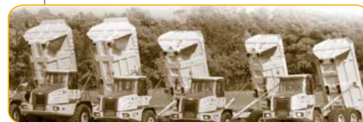
2003 Truck assembly operations commence in Europe.