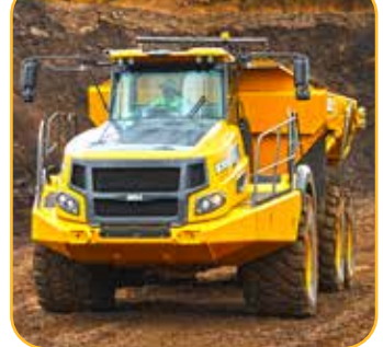
2002 Bell establishes beachhead in Russian market.