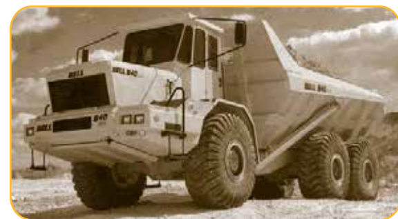
1984 Applying the Hauler's strong, simple design philosophy, Bell enters the Wheeled Loader market.