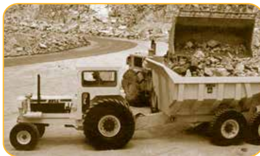
1964 Bell introduces the world's first heavy-duty Africa haulage tractor.