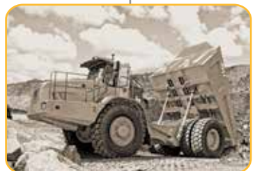
2013 Production of the B60D Truck commences.