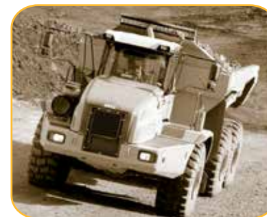
1989 Launch of the B40 Articulated Dump Truck, targeting heavy duty mining applications.