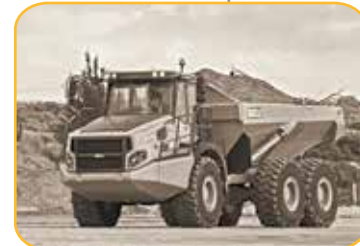
2008 E-series Small Truck released to the market.